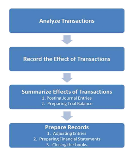
Fig. 2. Process of accounting.

documents. This is a balanced method, which ensures that the procedures can be used manually and technically.